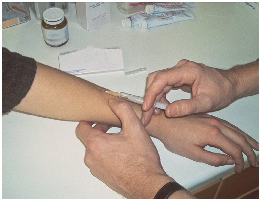
Anthroposophic medicinal products are applied, internally, externally and by injection

The range of anthroposophic medicinal products is partially determined by the physical characteristics of substances, and takes account of conventional medicinal, phytotherapeutic and homeopathic criteria. Most particularly, anthroposophic medicinal products are characterised by their manufacturing processes which involve specific anthroposophic and/or typical homeopathic pharmaceutical procedures. They are manufactured according to pharmacopoeia standards (see Chapter 3 ).