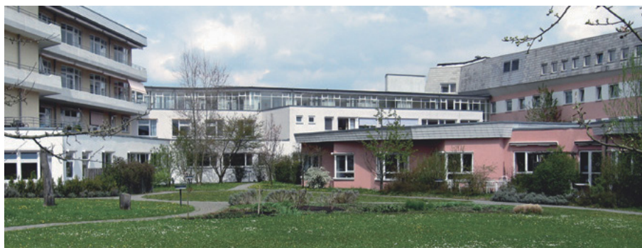
Anthroposophic clinic and public hospital - 'Filderklinik', Filderstadt, Germany