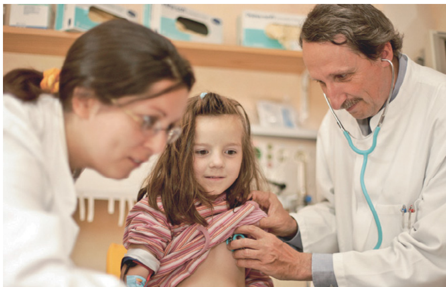
Anthroposophic medicine is provided in both primary and clinical care.

Patients of anthroposophic health care are as diverse as patients who use other forms of medicine. Anthroposophic medicine is used by anyone who wishes to seek self-management and active participation in the therapy and the healing process. Some patients seek to use the whole range of anthroposophic medical services available, whilst others use only specific services or medicinal products which they find helpful to their specific circumstances. Nevertheless studies show that patients treated with anthroposophic medicine are more severely affected or have been ill for a longer period before starting therapy. 40