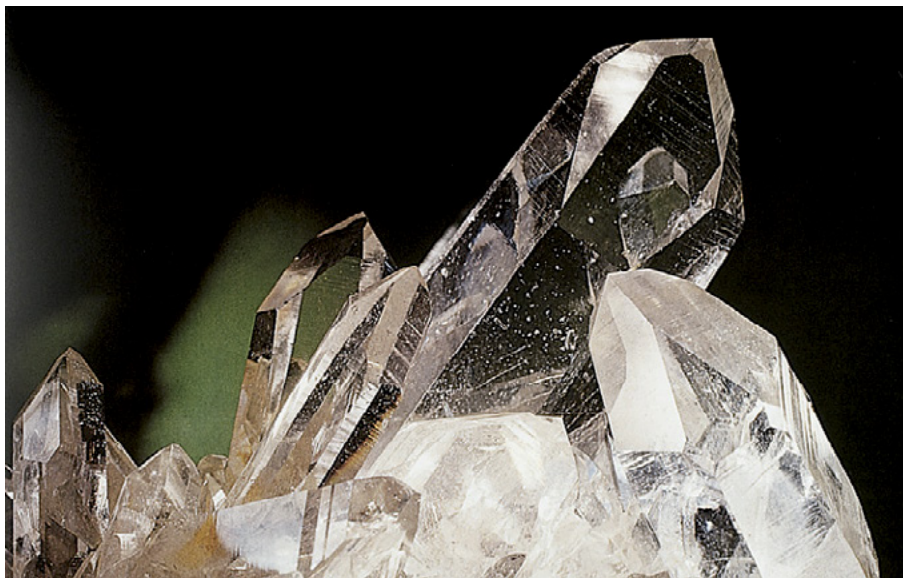
Mineral Quartz is one of the substances used in anthroposophic medicinal products

Anthroposophic medicine uses a broad variety of anthroposophic medicinal products from minerals, animals and different parts of plants in a variety of routes of application and various concentrations or potencies according to the disease, part of the body and body function affected and to the age and condition of the patient.