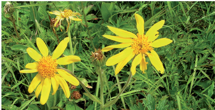
Arnica montana is used in anthroposophic medicine

Self-management contributes to self-healing. This is reflected in the lifelong capacity of a human being to learn and in the way in which an individual seeks to make sense of his or her own biography .