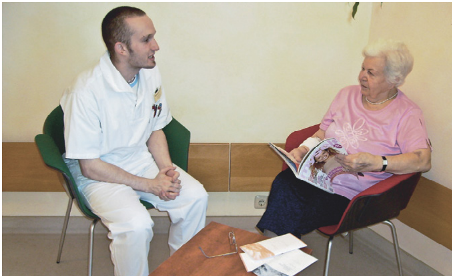
The patient-doctor relationship is central in anthroposophic medicine

Anthroposophic medicine is practised by physicians with a dual training; they have to be fully qualified as a physician first and then to successfully complete a further three years of training as an anthroposophic doctor. It is practised in multi-disciplinary therapeutic settings or clinics and anthroposophic physicians are active in general practice as well as in all specialist fields of medicine. Anthroposophic medicine is a medical system offering sustainable and cost-effective solutions for public health. 6,7