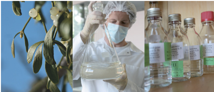
Viscum album - Mistletoe

Professional competence in anthroposophic pharmacy is provided by the associations of anthroposophic pharmacists which are also responsible for training and research and development (see Annex 2).