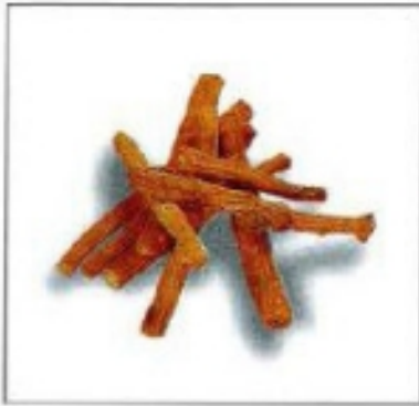
Achyranthes ( niu xi )