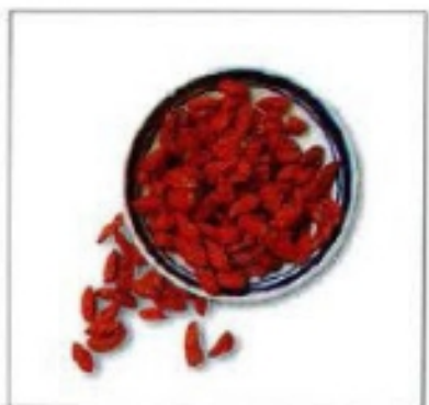
Chinese Wolfberry ( gou qizi )