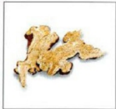
Atractylodes ( bai zhu )