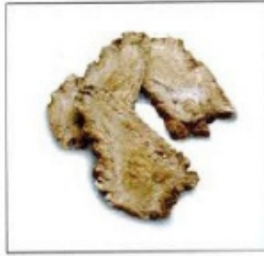
Pseudoginseng ( tian qi )