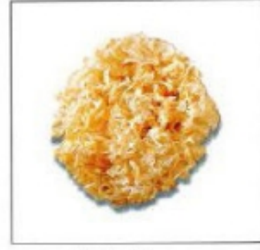
White fungus ( bai mu er )