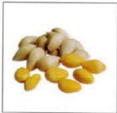
Ginkgo nuts ( bai guo )