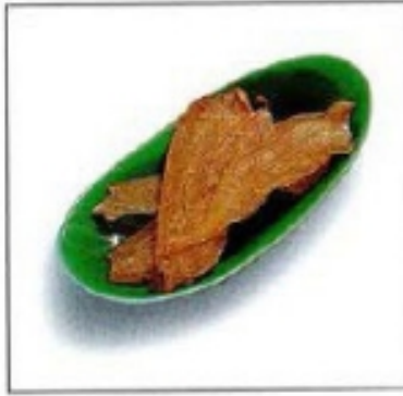
Shiny Asparagus ( tian men dong )