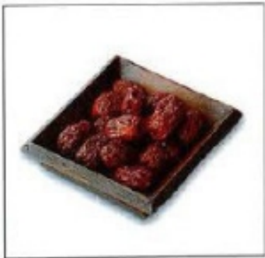
Red dates ( hong zao )