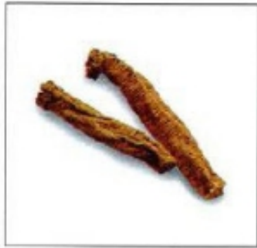
Codonopsis Root ( dang shen )