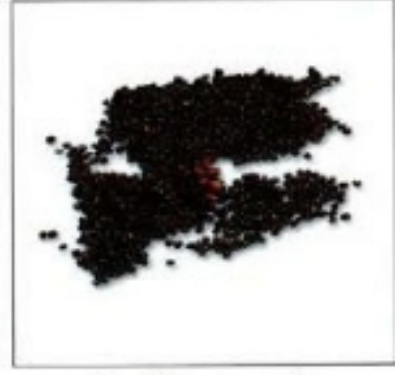
Quail grass seeds ( qing xiang zi )