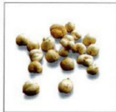
Fritillaria ( bei mu )