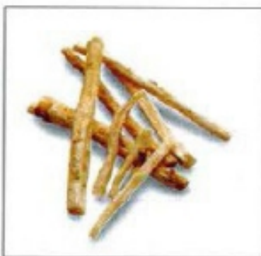
Glehnia Root ( sha shen )