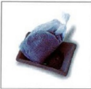
Caltrop ( bai ji li )