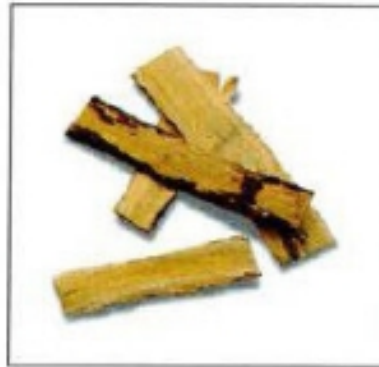
Astragalus ( huang qi )