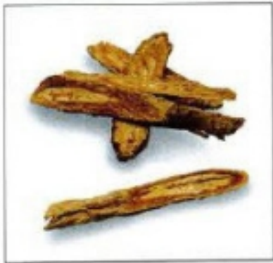
Ledebouriella Root ( fang feng )