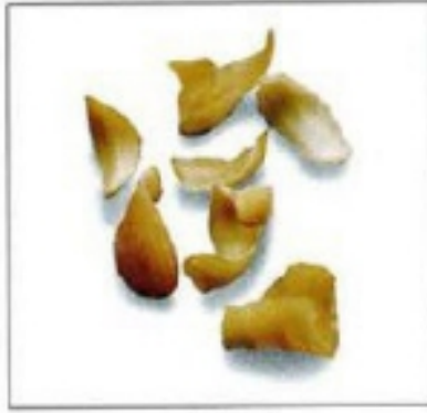
Lily bulb ( bai he )