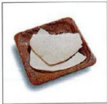
Tuckahoe ( fu ling )