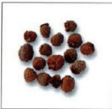
Chinese raspberry ( fu pen zi )