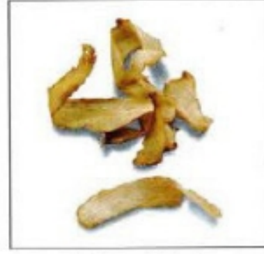
Solomon's Seal ( yu zhu )