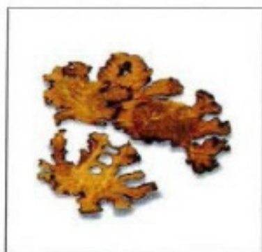
Hemlock Parsley Root ( chuan xiong )