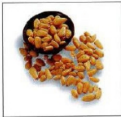
Pine seeds ( song zi )