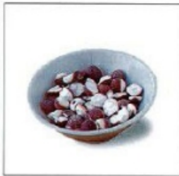
Foxnut ( qian shi )