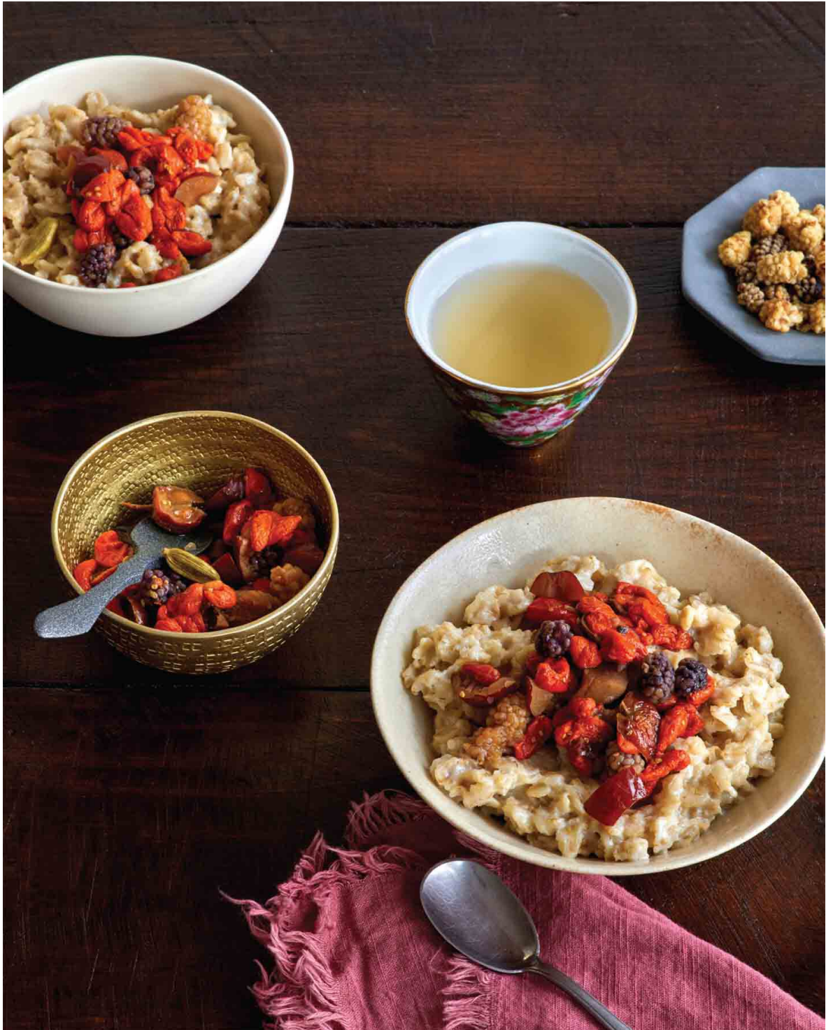
Fruit Blend with Blood-Building Herbs