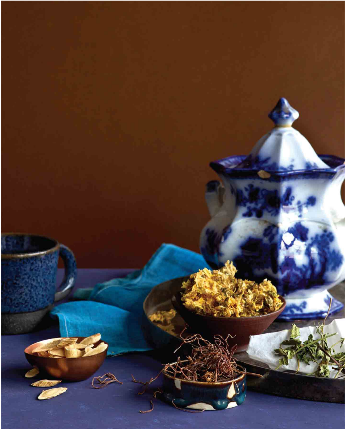
Decoction for a Cold with a Dry Cough