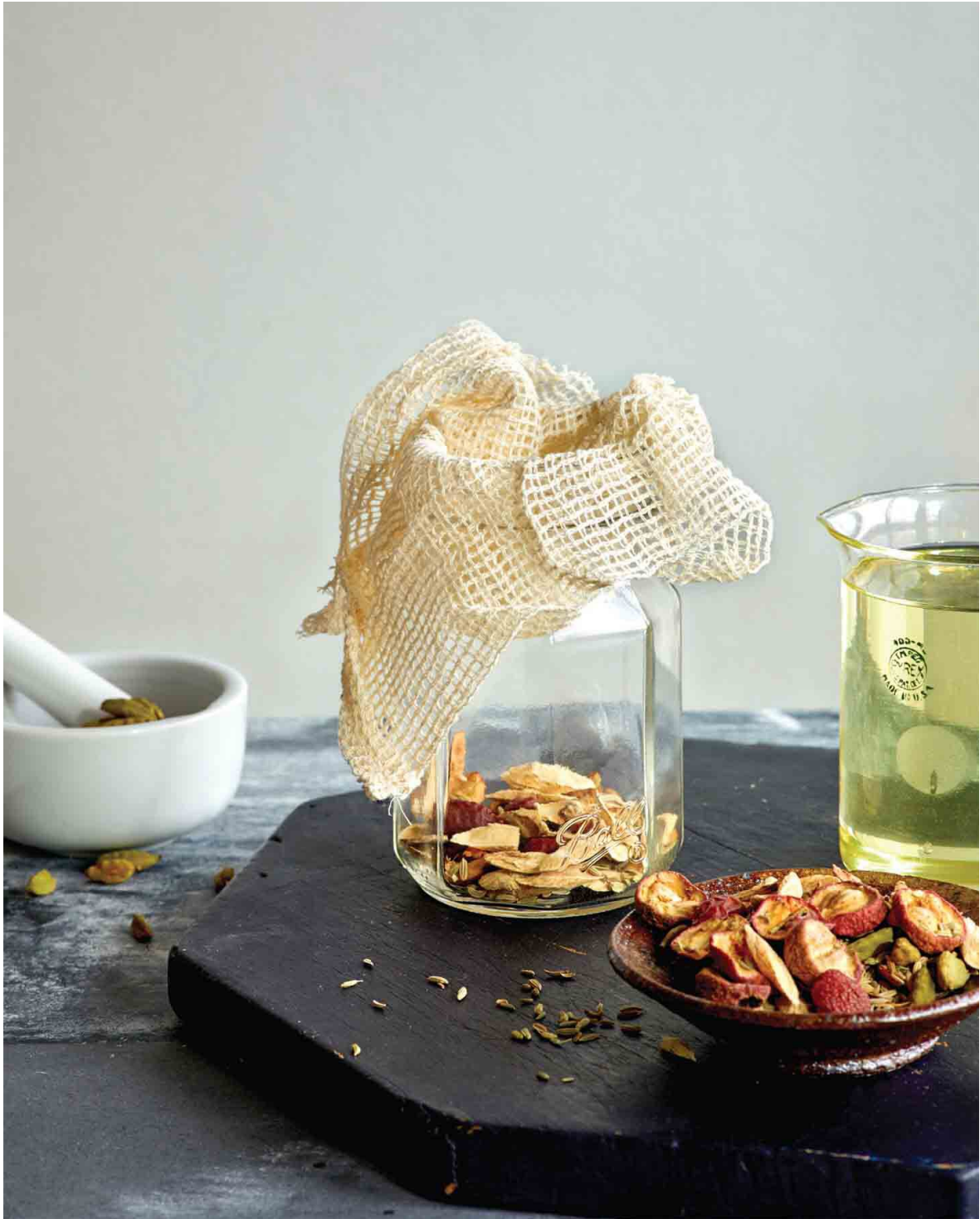
Herbal Oil for Abdominal Health