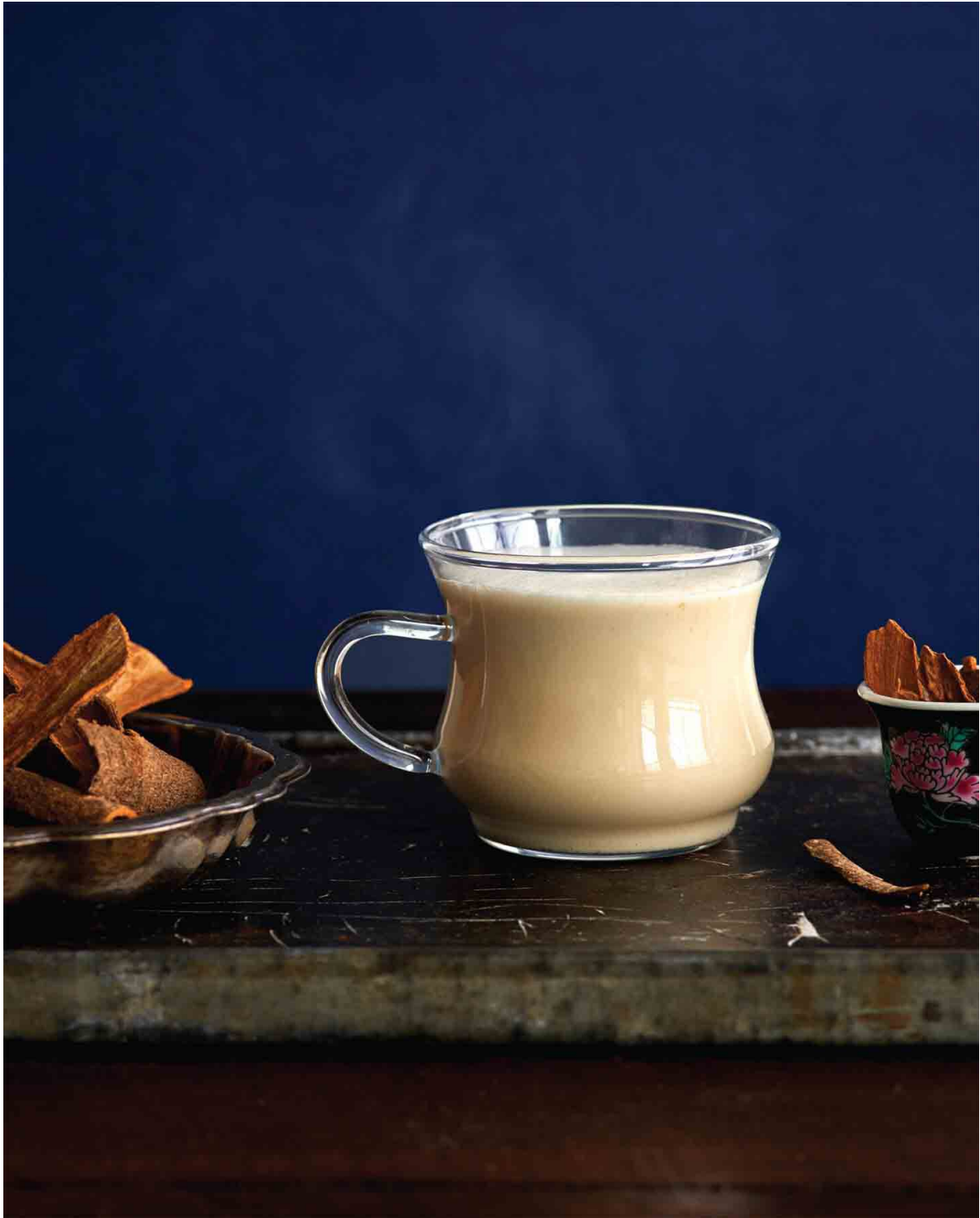
Diabetes-Friendly Cinnamon Tea