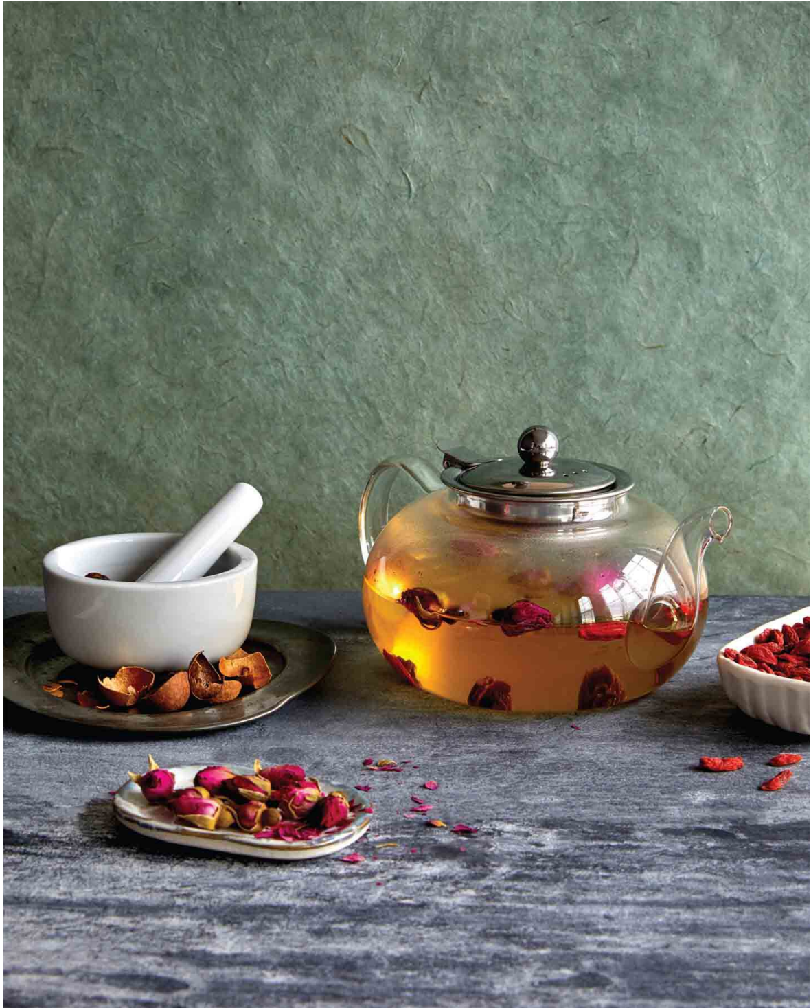
Decoction to Calm Anxiety