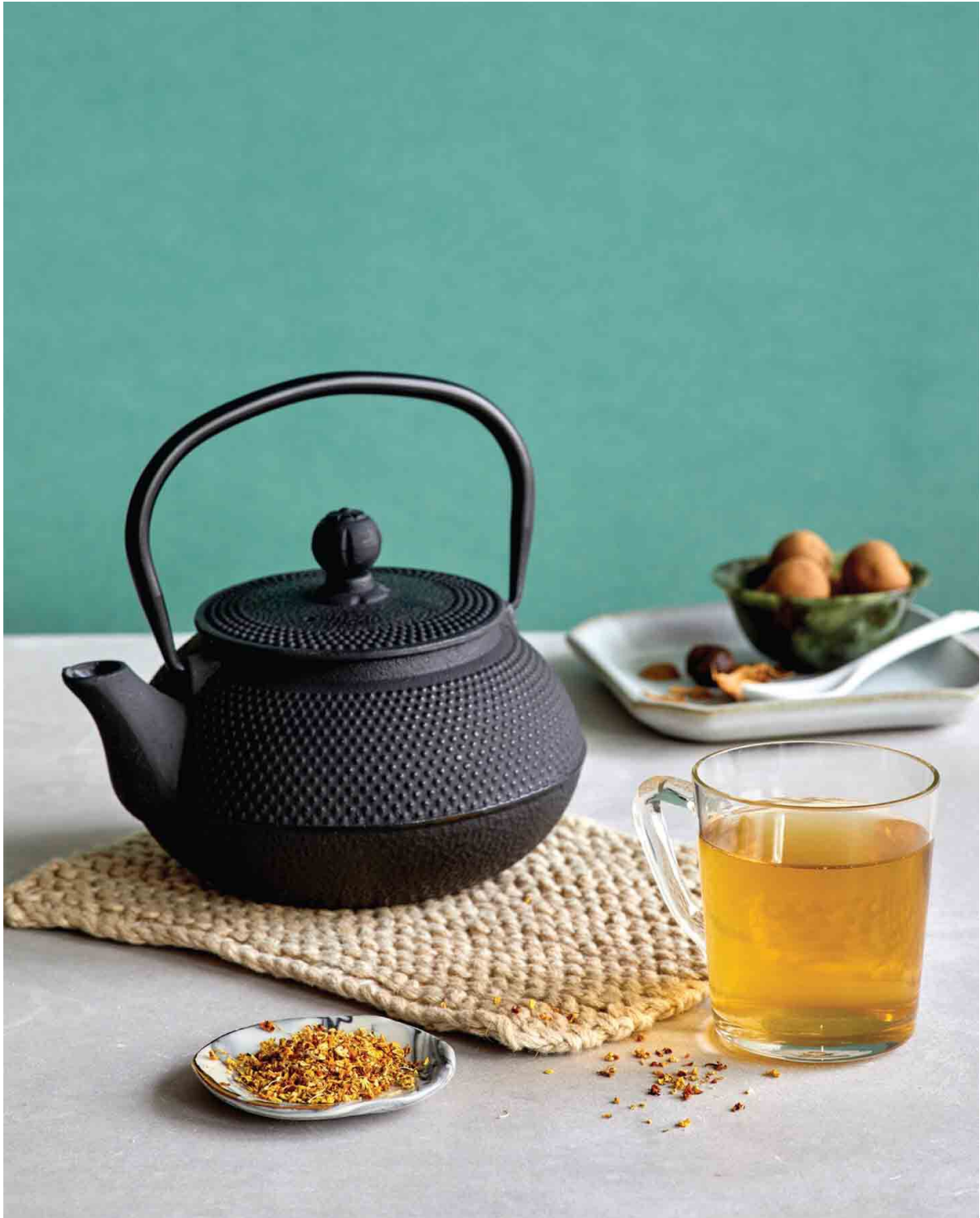
Infusion for Falling Asleep