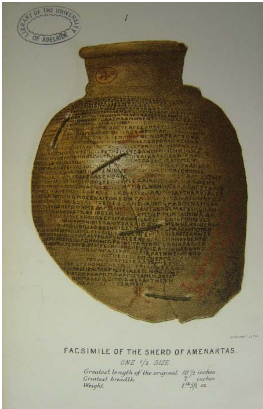
Facsimile of The Sherd of Amenartas