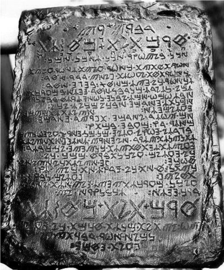
The Emerald Tablet of Thoth/Hermes