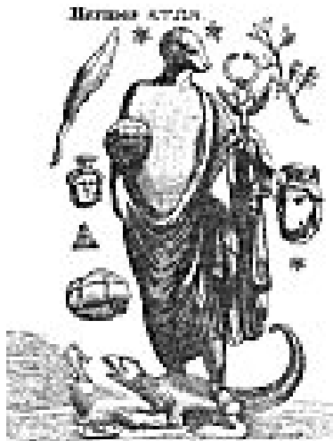
A GREEK FORM OF HERMES.

"Then God spoke to the Holy Word within the soul of all things, saying: 'Increase in increasing and multiply in multitudes, all you, my creatures and workmanships. Let him that is endued with Mind know himself to be immortal and that the cause of death is the love of the body; and let him learn all things that are, for he who has recognized himself enters into the state of Good.'