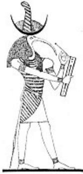
THOTH, THE IBIS-HEADED.

From Wilkinson's Manners & Customs of the Ancient Egyptians .