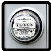
CLASSIC ANALOG METER