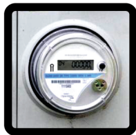
NEW "SMART" METER